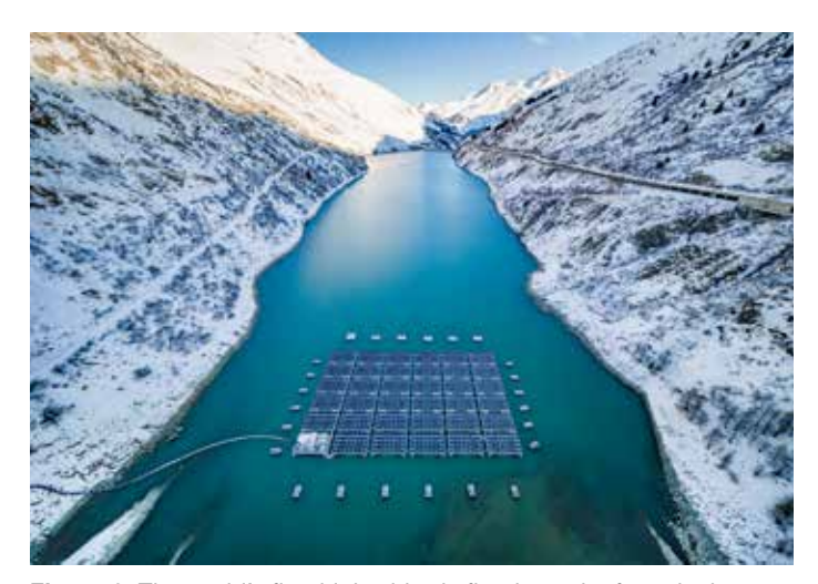
Figure 3: The world's first high-altitude floating solar farm, in the canton of Valais.