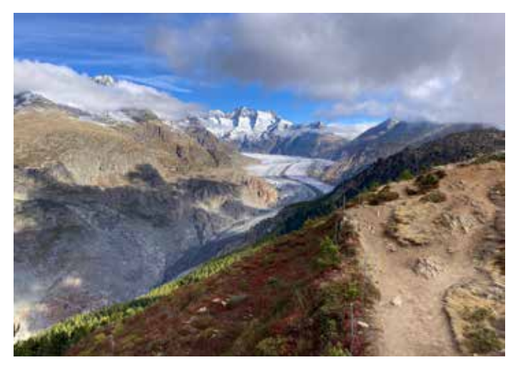
Figure 1: The Aletsch Glacier, the largest glacier in the Alps, as viewed from the Riederfurka.