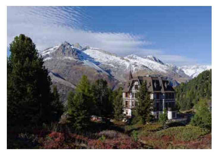
Figure 4: The Villa Cassel, built at the turn of the 20th century for English nobleman Ernest Cassel on the Riederfurka in the Valaisan Alps.